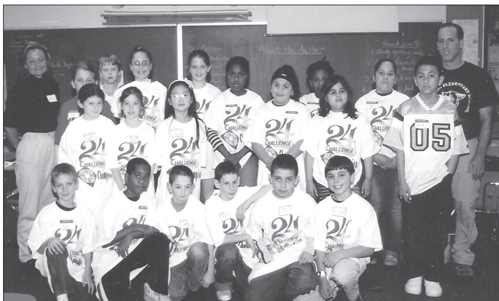
Math 24 Challenge Tournament: CP and Washington (Trenton) Teams and Coaches