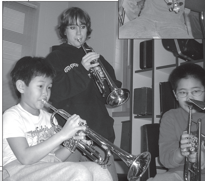
Music After School: Practice, Practice, Practice